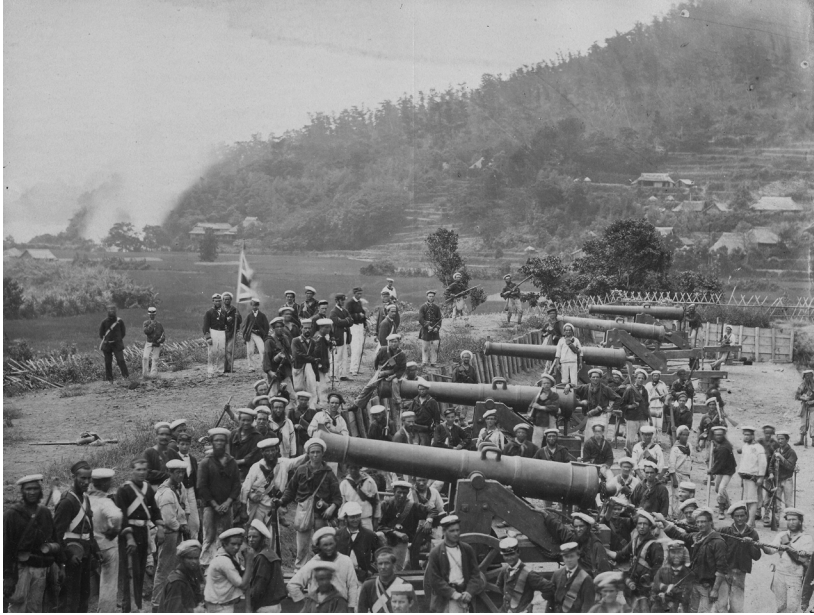
Fig. 1. Felice Beato, Shimonoseki. La 2ème Batterie de Matamoura (British Naval Landing Party at the Maedamura Battery, Shimonoseki), 1864, albumen silver print, courtesy of the J. Paul Getty Museum, Los Angeles. Partial gift from the Wilson Centre for Photography.

Tilted upward to face the water, the five captured cannon create a diagonal structural line that links with the downward-sloping hill somewhere beyond the picture's left edge. The resulting triangular form embraces the presumed focal point, a half-limp Union Jack. The national emblem has been made ghostly by a long exposure, inscribing duration into this instant and marking the image as a process and not a thing. Like all skies photographed using the blue-sensitive wet collodion process, the one behind this dazed victory party is overexposed and thus vacant. Almost invisibly, a plume of smoke dissipates. As in the first stanza of Wordsworth's "Tintern Abbey" (1798), which describes "wreathes of smoke / Sent up, in silence, from among the trees" (lines 18-19) the smoke here offers what Wordsworth called "uncertain notice" (20): it is a signifier whose referent cannot be directly ascertained. But where Wordsworth drew from a storehouse of tropes for poetic autonomy to imagine "vagrant dwellers" (21) and "some Hermit" (22) as the referents for his vaporous sign, we know from the cannon, the soldiers, and the date in the caption that a village full of Japanese peasants has been burned.