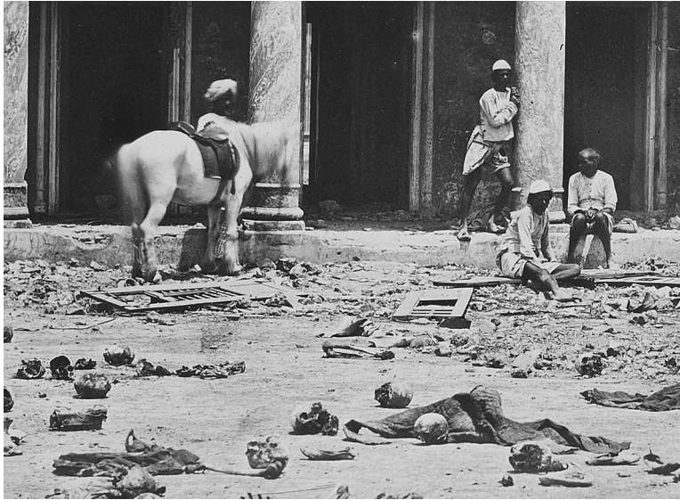
Fig. 4. Felice Beato, detail from Interior of the Secundra Bagh , courtesy of the Canadian Centre for Architecture, Montréal.

to fix a meaning to it “only guesses at intentions” (Prasch), while Chaudhary cites the photo’s “critical and reflexive engagement with itself” (99). Obsessively shaped and openly artificial, this actively reconfigured sign of an already-mediated event has been translated through any number of physical processes and formal vocabularies—the digging of the bones, the preparation of the plates, the formalist arrangement of broken wood. Each of these mediating processes remains visible in the photo itself; these steps of figuration can themselves be seen as the photo’s content, what it is about.