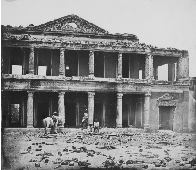
Fig. 3. Felice Beato, Interior of the Secundra Bagh after the Slaughter of 2,000 Rebels by the 93rd Highlanders and 4th Punjab Regiment. First Attack of Sir Colin Campbell in November 1857, Lucknow, 1858 , albumen silver print, courtesy of the Canadian Centre for Architecture, Montréal.

of reading. The massacre it seeks to commemorate was a decisive one in the British counterinsurgency. Indian fighters had retreated to the fortress at Lucknow, the city at the center of the Awadh (Oudh) region, which, thanks to Henry Havelock's relief of the residency complex there in September 1857 and Colin Campbell's second reoccupation of the city that November, had become ground zero for British mythologies of the revolt (Bayly 181). When the fortress walls were finally breached in that second liberation, Campbell sent in the Sikhs and Scots, who systematically executed some two thousand Indians. Like other episodes of British valor, the killing at Lucknow was instantly memorialized in ballads, lithographs, eyewitness accounts, and historical overviews both popular and scholarly, nearly all of them emphasizing how, for example, "gallant Highlanders" and "daring and invincible Sikhs . . . deal[t] death" to "the miscreants, the blood-stained monsters of Cawnpore" ( Sepoy's Daughter 440). Eyewitness Frederick Roberts recalled it more vividly: